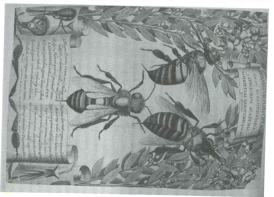
4. Francesco Stelluti's Melissographia (1625), produced using a microscope provided by Galileo, and dedicated to Pope Urban VIII

Debates between realists and anti-realists continue to form a lively and fascinating part of the philosophy of science. Each side rests on a very plausible intuition. The realist intuition is that our sense impressions are caused by an external world that exists and has properties independently of human observers, so that it is reasonable to try to discover what those properties are, whether the entities in question are directly observable by us or